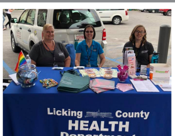
Licking County Health Department

The health department's Community Cessation Initiative (CCI) works to connect community members with tobacco cessation services through a referral network. In 2019, CCI has enrolled 290 individuals into tobacco cessation programs.