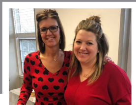
Licking County Health Department

The health department's CMH program assists Licking County families with children who have eligible conditions including: Chronic Pulmonary Disease, Diabetes, Juvenile Arthritis, Cystic Fibrosis, Cancer, Cleft Lip/Palate, Cerebral Palsy, Hemophilia, Spina Bifida, Hearing Loss, Heart Defects, and Seizure disorders. In 2019, LCHD nurses have made 65 CMH home visits.