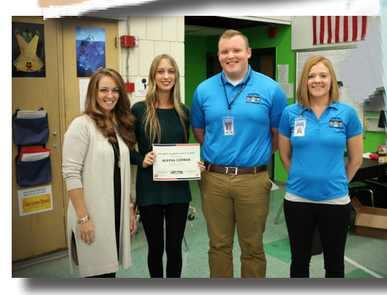
Licking County Health Department

Community Cessation Initiative (CCI): The Licking County Health Department is working to increase capacity for tobacco cessation within each county. CCI is a program designed to connect individuals who wish to quit smoking or using tobacco products with local cessation services. In 2018, CCI served 182 individuals in Licking County.